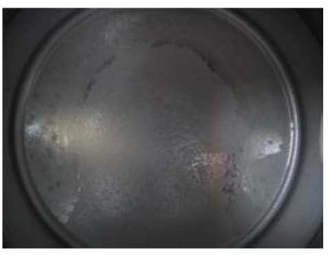
Mineral left over after boiling 20 L of SPECIAL Filter (Model : SP 520) Treated Water

To get a Special flavorful coffee, there must be mineral content in the water.