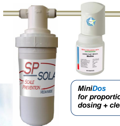
MiniDos for proportional dosing + cleaning