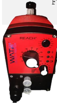
Shipping weight PV

Watch-Water® GmbH Fahrlachstraße 14 68165 Mannheim, Germany Tel. +49 621 87951-0 Fax +49 621 87951-99 info@watchwater.de