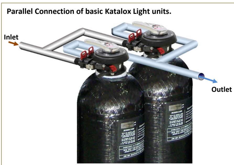
Parallel Connection of basic Katalox Light units.