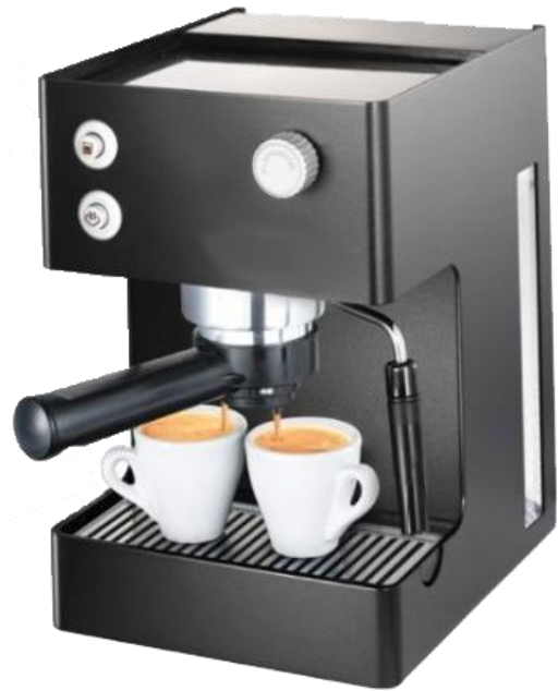
Helping Coffee flow smoothly