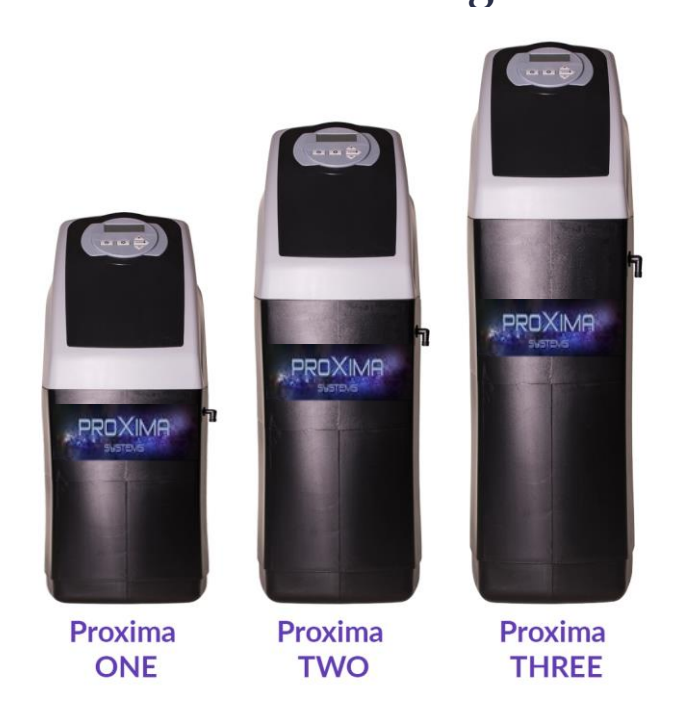
PART I: Residential System

It's time to get serious about water softeners for Homes and Buildings